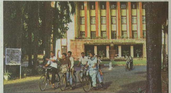
■ IIT Kharagpur had objected to the UGC's direction to roll back courses not recognised by the universities.

The UGC had recently forced Indian Institute of Science (IISc) Bangalore to change the name of its course under the same regulation.